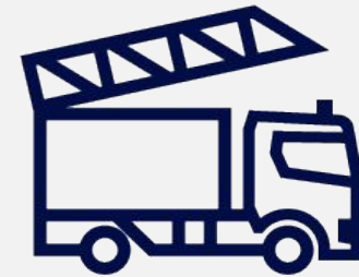
Fire and Rescue